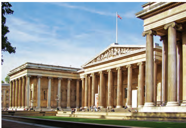
British Museum, England

British colonies. Presently the museum collection comprises about 80 lakh objects.