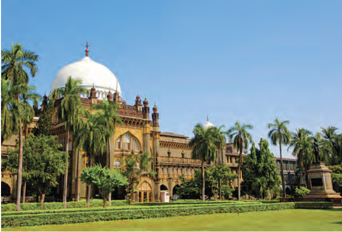
Chhatrapati Shivaji Maharaj Vastusangrahalay

The building of the museum is built in Indo-Gothic style. It has been given the status of Grade I Heritage Building in Mumbai. The museum houses about 50 thousand antiquities divided into three categories, Arts, Archaeology and Natural History.