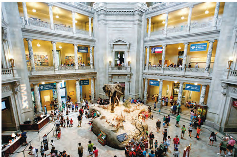
National Museum of Natural History

National Museum of natural History, United States of America : This museum of natural history managed by the Smithsonian Institution was established in 1846 C.E. It houses more than 12 crore (120 millions) specimens of fossils and remains of plants and animals, minerals, rocks, human fossils and artefacts.