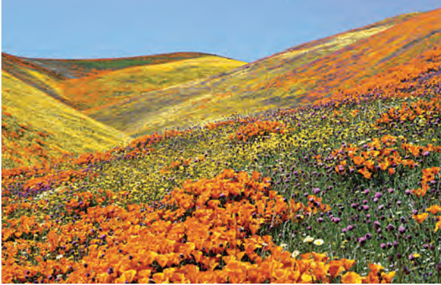
Valley of Flowers

important places related to the Indian war of independence in 1857, etc.