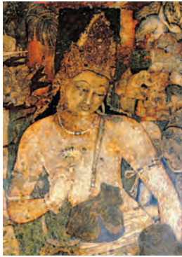
The mural of Bodhisattva Padmapani

Paintings are two dimensional, for example, sketches or paintings of nature, objects and individuals. They are done on various surfaces, such as rocks, walls, papers, canvas of different types and earthen pots. The mural of Bodhisattva at Ajanta caves is one of the finest examples of the art of painting.