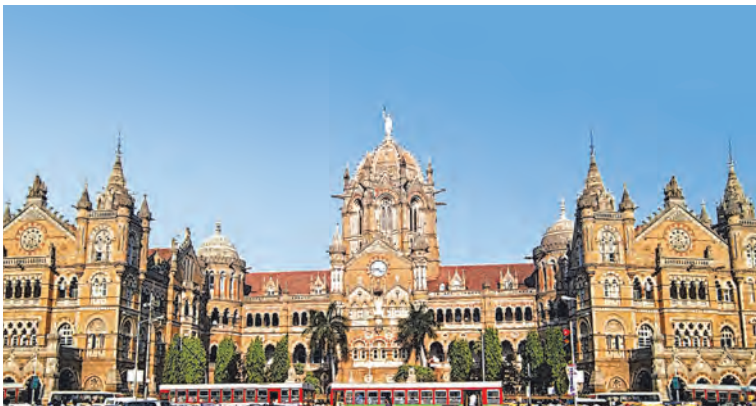
Chhatrapati Shivaji Maharaj Railway Terminus

During the British period a new architectural style arose in India. It is known as Indo-Gothic architectural style. Buildings like Churches, government offices, residences of top officials, railway stations were built in this style during the British period. The building of