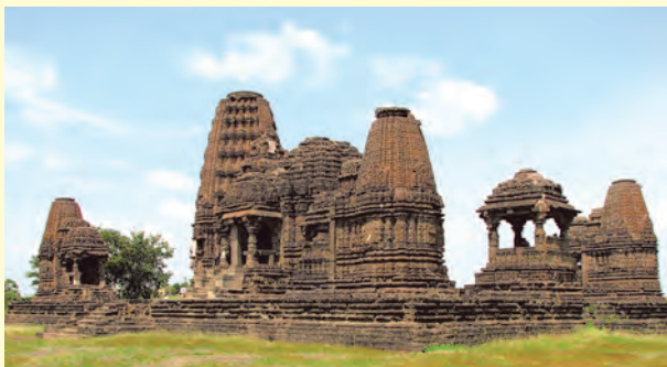
Gondeshwar Temple - Sinnar

Temples in Maharashtra built in 12th-13th centuries are known as Hemadpanti temples. The outer walls of Hemadpanti temples are built in a star shape. In the star-shaped plan, the outer walls of the temple has a zigzag design. This results into an interesting effect of alternating light and shadow. The important characteristic of Hemadpanti temple is its masonry. The walls are built without using any mortar, by locking the stones by using the technique of tenon and mortise joints. The Ambreshwar temple at Ambarnath near Mumbai, Gondeshwar temple at Sinnar near Nashik, Aundha Nagnath temple in the Hingoli district are a few finest examples of the Hemadpanti style. Their plan is star-shaped. The Hemadpanti temples are found at several places in Maharashtra.