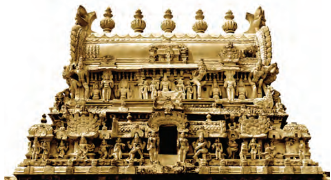
Dravida Style Gopura

The styles of temple architecture are identified by the style of the tower ( Shikhara ). The Nagara style of North India and the Dravida style of South India are the two principal styles of Indian temple architecture. A blend of these two styles is known as Vesara style. The Bhoomija style seen in Madhya Pradesh and Maharashtra has a close resemblance to the Nagara style from the structural viewpoint. In the Bhoomija style, series of miniature towers are arranged, which become smaller toward the top. Hence, the tower appears to be continuously rising from the base of the temple to the top.