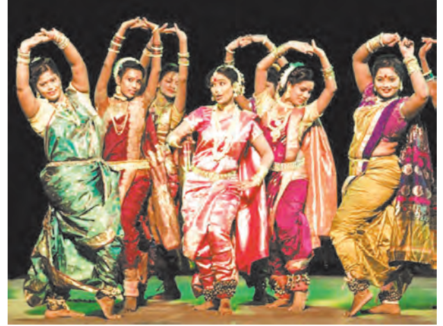
Lavani - Maharashtra

A beautiful blend of all three forms of music, vocal, instrumental and dance can be seen in various Indian classical dance forms like ‘Kathak of north India, ‘Lavani’ of Maharashtra, ‘Odisi’ of Odisha, ‘Bharatnatyam’ of Tamilnadu, Kuchipudi of Andhra and ‘Kathakali’ and ‘Mohiniattam’ of Kerala.