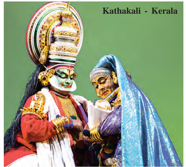
Kathakali - Kerala

In India in the post-independence period various festivals of music and dance are organised with a view to make it accessible to common people. Many people attend these festivals, including Indians and foreigners alike. The ‘Savai Gandharva’ festival of Pune is a famous one.