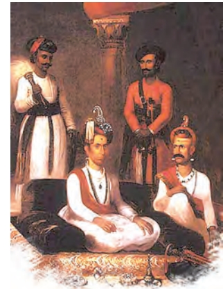
Savai Madhavrao and Nana Phadnavis