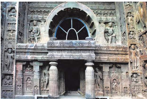
Ajantha Cave – No. 19 Entrance

Architecture and Sculpture : There are a number of rock-cut caves in India. The tradition of rock-cut caves originated in India in the 3rd century B.C.E. Technically the entire composition of a rock-cut cave represents a union of architecture and sculptural art. Its entrances, interiors with its carved columns and images are excellent specimens of sculptural art. The paintings on the walls and ceiling have survived in some of the caves till today. The rock-cut caves at Ajanta and Verul in Maharashtra were declared as World Heritage in 1983.