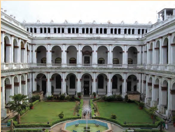
Indian Museum, Kolkata

The 'Indian Museum' at Kolkata was founded by the Asiatic Society in 1814 C.E. Nathaniel Wallich, a Danish botanist was the founder and the first curator of the museum. The photograph of the museum seen here is dated to 1905. The museum has three main departments, Arts, Archaeology and Anthropology. Other affiliated departments are : conservation, publication, photography, exhibition-presentation, model-making, training, library, security.