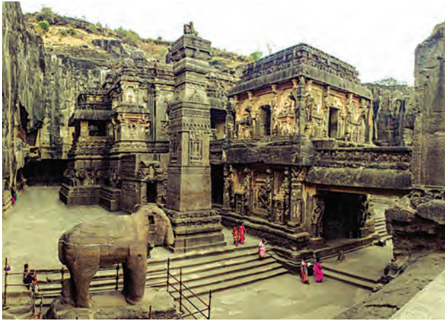
Kailasa Temple, Verul

‘Cultural and Natural Heritage Management’ is one of the main aspects of applied history. The work of conservation and preservation of the Cultural Heritage falls under the jurisdiction of the Archaeological Survey of India and India’s State Departments of Archaeology. Beside, INTACH (Indian National Trust for Art and Cultural Heritage) is actively working in this field. The work of conservation and preservation of cultural and natural heritage requires participation of experts from various fields. They need to be duly aware of the cultural, social and political histories of the heritage site. Principles of applied history are useful in creating the awareness among them. Thus,