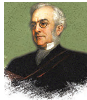
Friedrich Max Muller

Lately, Edward Said, a scholar who has re-evaluated the orientalist writings, has thrown light on imperialistic interests of orientalist scholars.