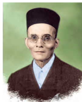
Vinayak D. Savarkar

movement of the Indian people against the British. In this aspect the book, 'The Indian War of Independence, 1857', written by Vinayak Damodar Savarkar is of great importance.