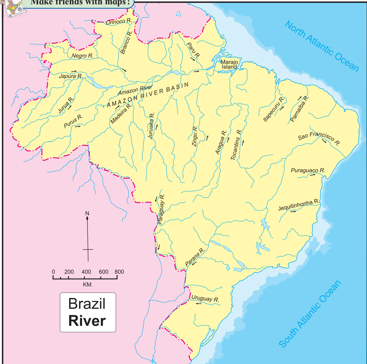
Figure 3.4 : Brazil - Drainage

Paraguay-Parana system : These two rivers are located in the southwestern part of Brazil. Both the rivers form the catchment of River Plata in Argentina. These two rivers and river Uruguay in extreme south of the highlands collect their headwaters from the southern portion of the highlands.