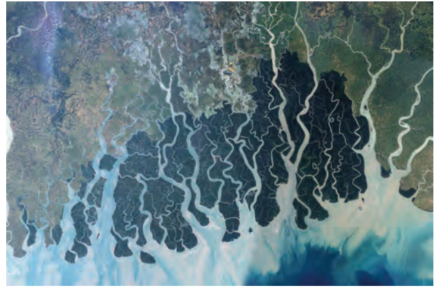
Figure 3.3 : The image of Sunderban Delta

Most of the West Bengal State of India and Bangladesh together constitute the delta of Ganga-Brahmaputra system. It is known as Sunderbans. It is considered to be the world's largest delta. See Fig 3.3.